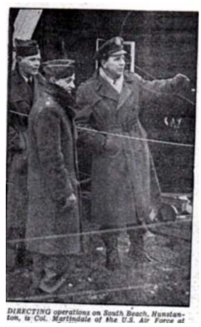
The Americans from Scuthorpe did sterling work at Hunstanton during the coastal floods of 1953 creating two heroes. !7 Americans who were living in holiday bungalows sadly lost their lives. The County awarded the 47BW with an award of a silver pheasant in recognition of their efforts.