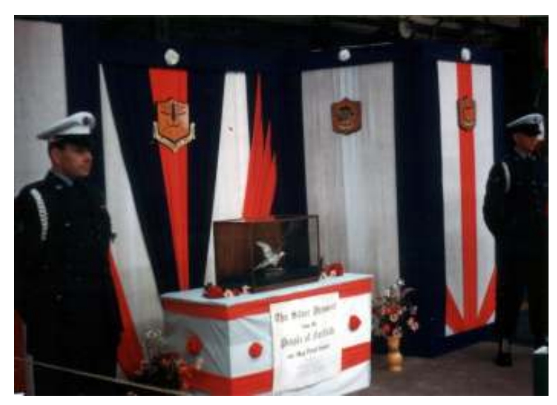
The Silver Pheasant. The original was destroyed by fire at Norwich Libary