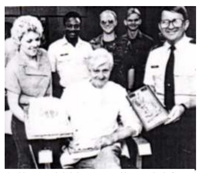
Sculthorpe neede hairdressers too. This one retired after serving for 25 years!