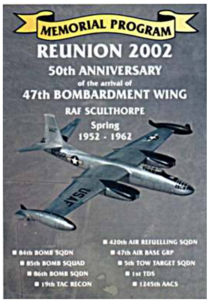
In 2002 many former airmen who had served at Sculthorpe came back for a renunion