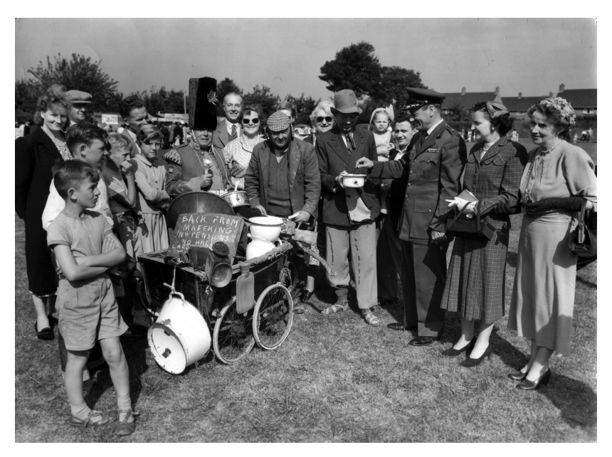
An American Officer and his two ladies patrornise a fete on Fakenham's Queens Road playing field in 1955.