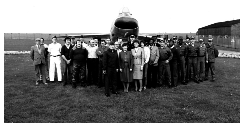
Americans and civilians at Sculthorpe in the early 1990s by late 1992 all were gone.

The contribution that Sculthorpe made to the local economy has never been made known but considering the number of people it employed directly and indirectly the input must have been considerable